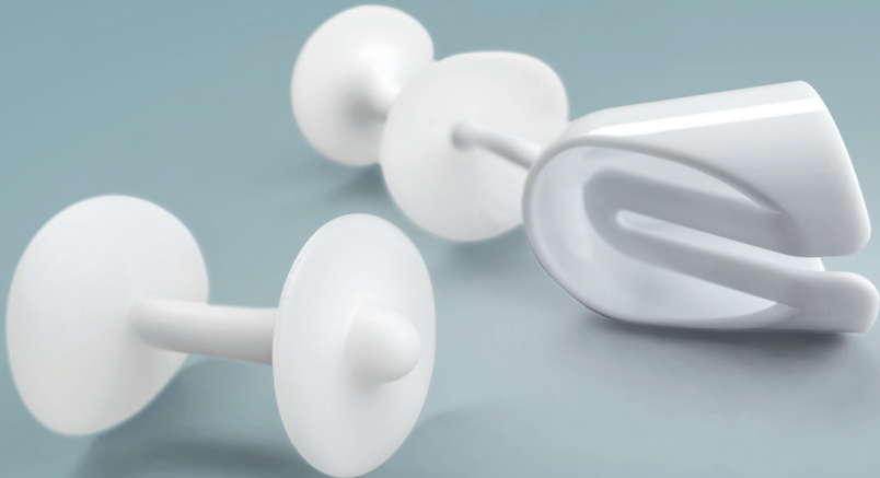
Renew Inserts with inserter